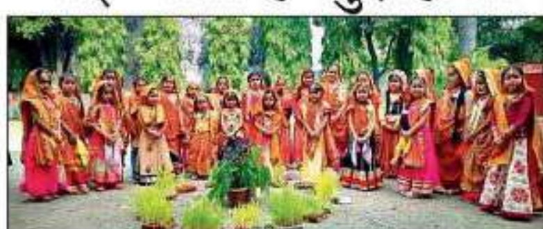
कानों पर रखी जाती हैं अनाज की पतियां, दी जाती है लंबी उम्र की दुआ