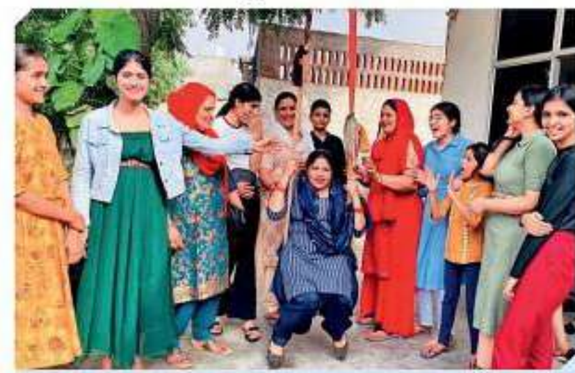
गुर्जर समाज में भी इस पर्व की तैयारियां जोर-शोर से शुरू हो चुकी हैं