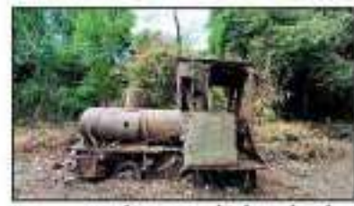
इसका इस्तेमाल गांवों से गन्ने को फ्रैक्टरी तक पहुंचाने के लिए होता था